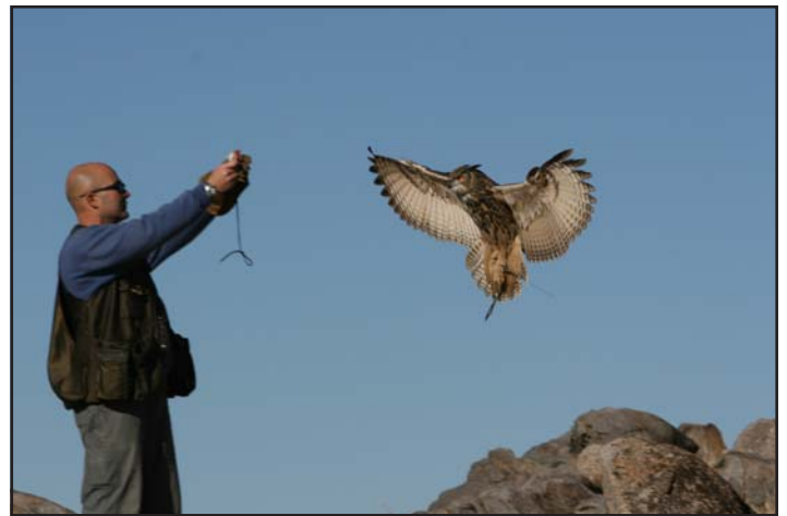
Bubu the Eurasian Eagle Owl

This entertaining Bird Show is featured every Saturday and Sunday at 10:15 AM and every Wednesday at 6:30 PM .