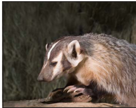
Beatrix, a North American badger