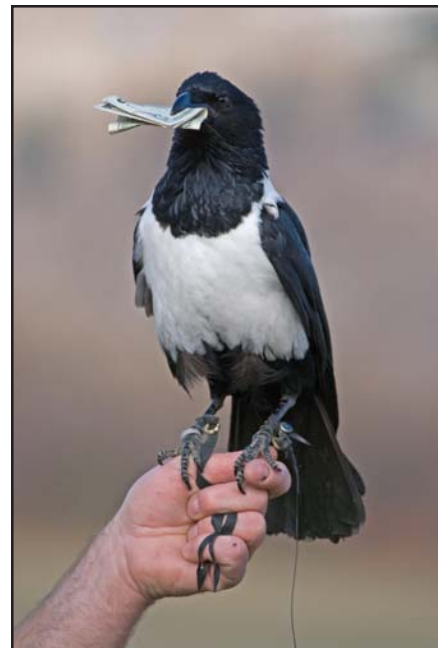
Sheryl the African Pied Crow with money taken from the audience