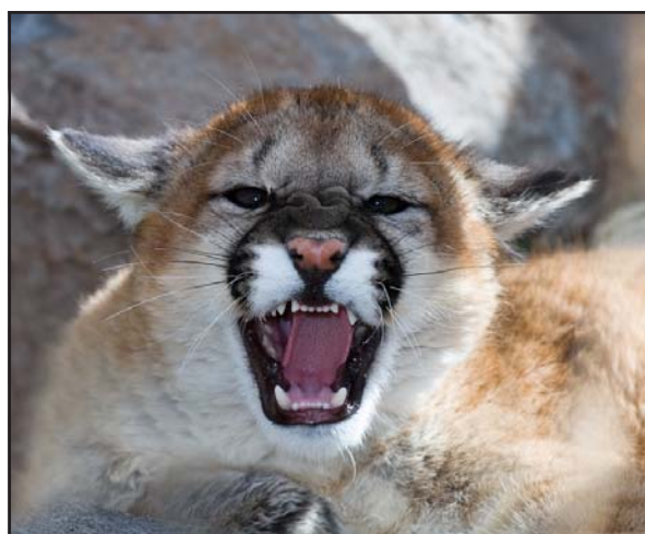
Milagro (Milo) - one of Animal Ark's newest residents

Animal Ark is a tax-exempt, non-profit nature center and sanctuary for non-releasable wildlife.