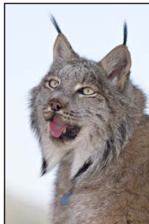
One of Animal Ark's newest residents - Legend the Canada Lynx

Come visit Beatrix and the other animals who have found sanctuary at Animal Ark over the last few months.